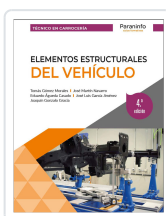
ELEMENTOS ESTRUCTURALES DEL VEHICULO 4.ª EDICIÓN 2023 MARTÍN DÍAZ, ULISES