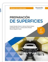
PREPARACIÓN DE SUPERFICIES 4.ª EDICIÓN 2023 MARTÍN NAVARRO, JOSÉ