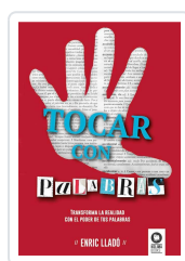
TOCAR CON PALABRAS LLADÓ MICHELÍ, ENRIC