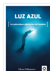
LUZ AZUL VILLANUEVA TOMAS, ULYSES