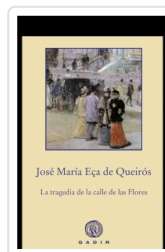
LA TRAGEDIA DE LA CALLE DE LAS FLORES EÇA DE QUEIRÓS, JOSÉ MARÍA