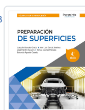
PREPARACIÓN DE SUPERFICIES 4.ª EDICIÓN 2023 MARTÍN NAVARRO, JOSÉ