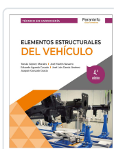
ELEMENTOS ESTRUCTURALES DEL VEHICULO 4.ª EDICIÓN 2023 MARTÍN DÍAZ, ULISES