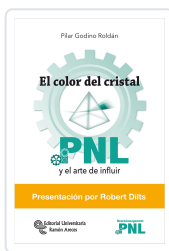
EL COLOR DEL CRISTAL GODINO ROLDÁN, PILAR